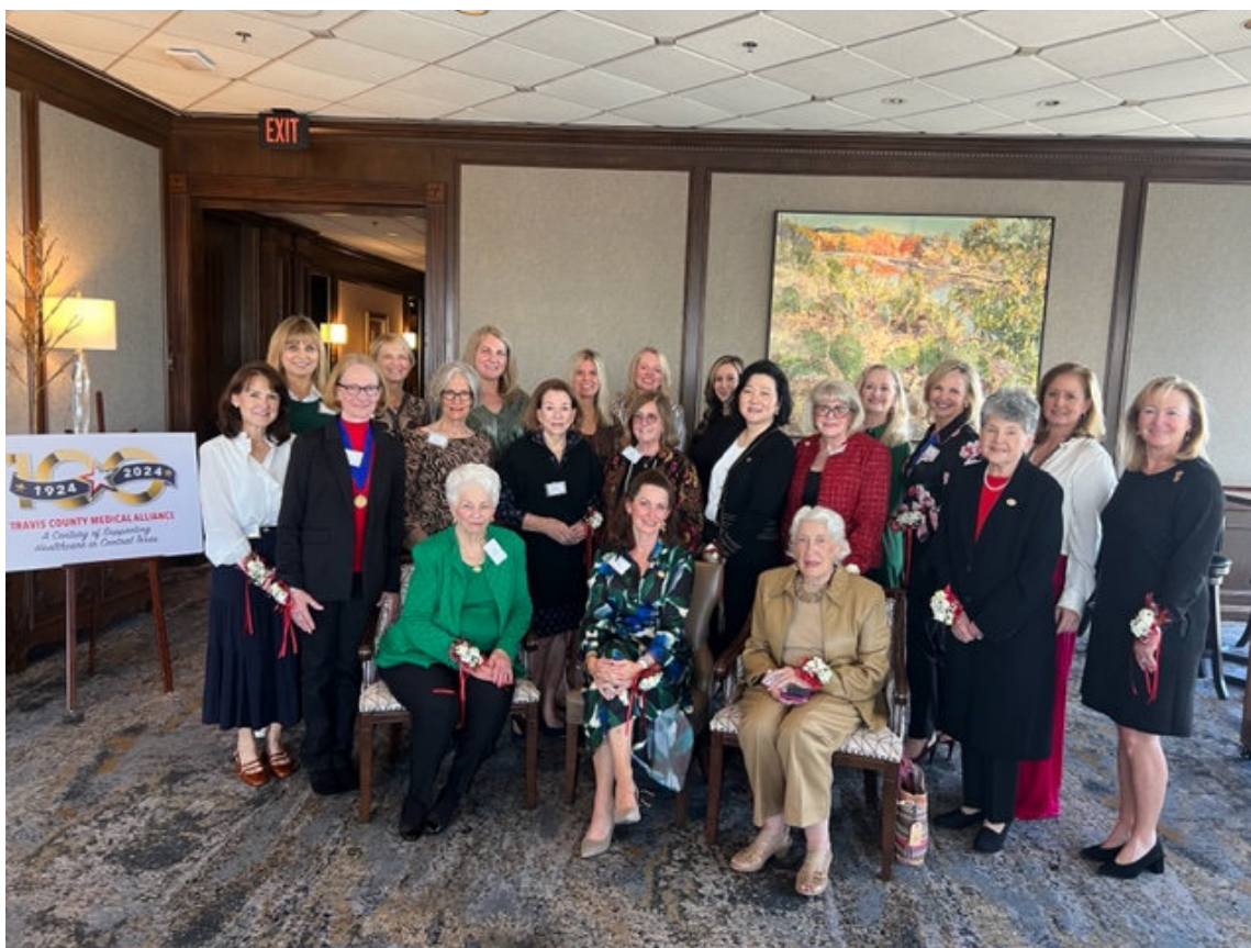
(above) The Legacy Continues ~ TCMA's Current and Past Presidents

On December 1st, TCMA hosted its annual holiday luncheon at the Headliners Club, where past presidents were recognized for their leadership. Guests were treated to a spectacular view of Downtown Austin, a delicious meal and many wonderful memories.