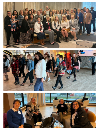
Group photo; line dancing and TCMA members meeting members from other alliances